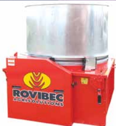
PF 600 Hay and straw processor